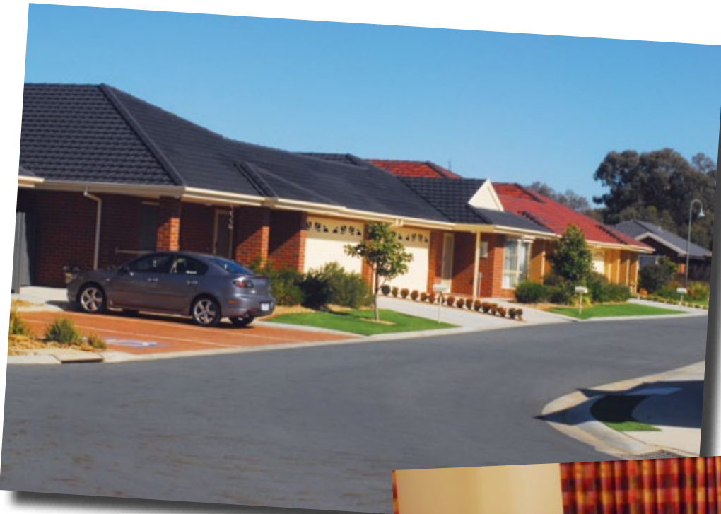
Cunningham Downs Village

For further information please contact the Director of Care Services at Wharparilla Lodge.