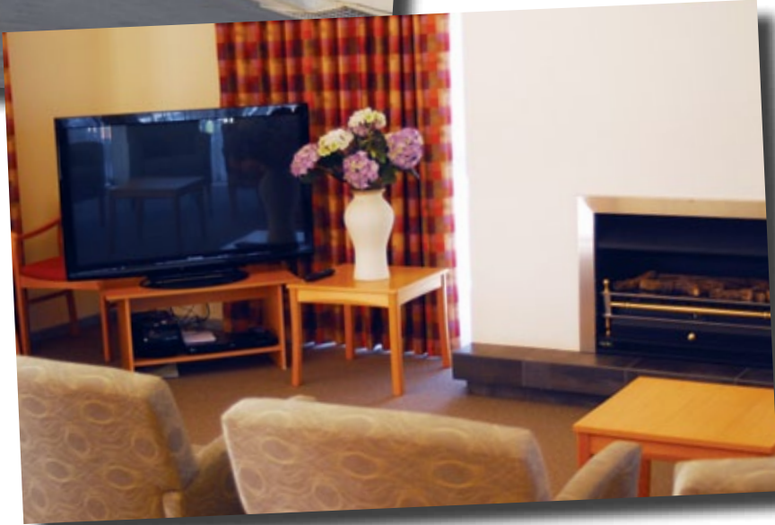
Brolga communal living room