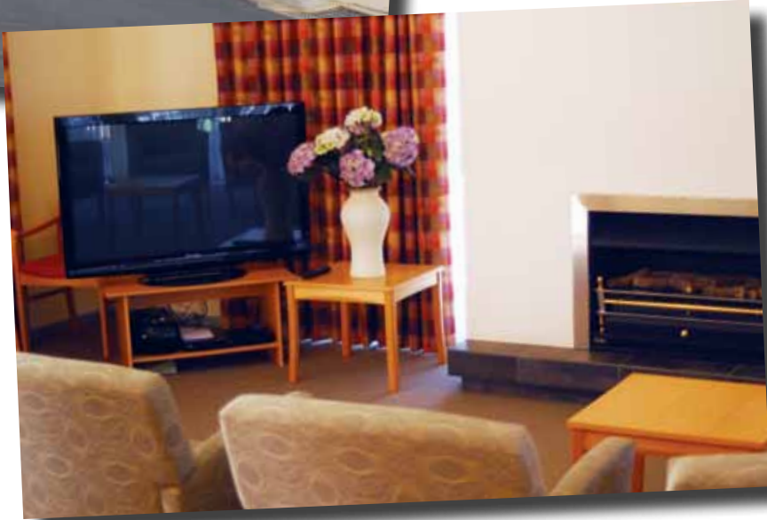
Brolga communal living room