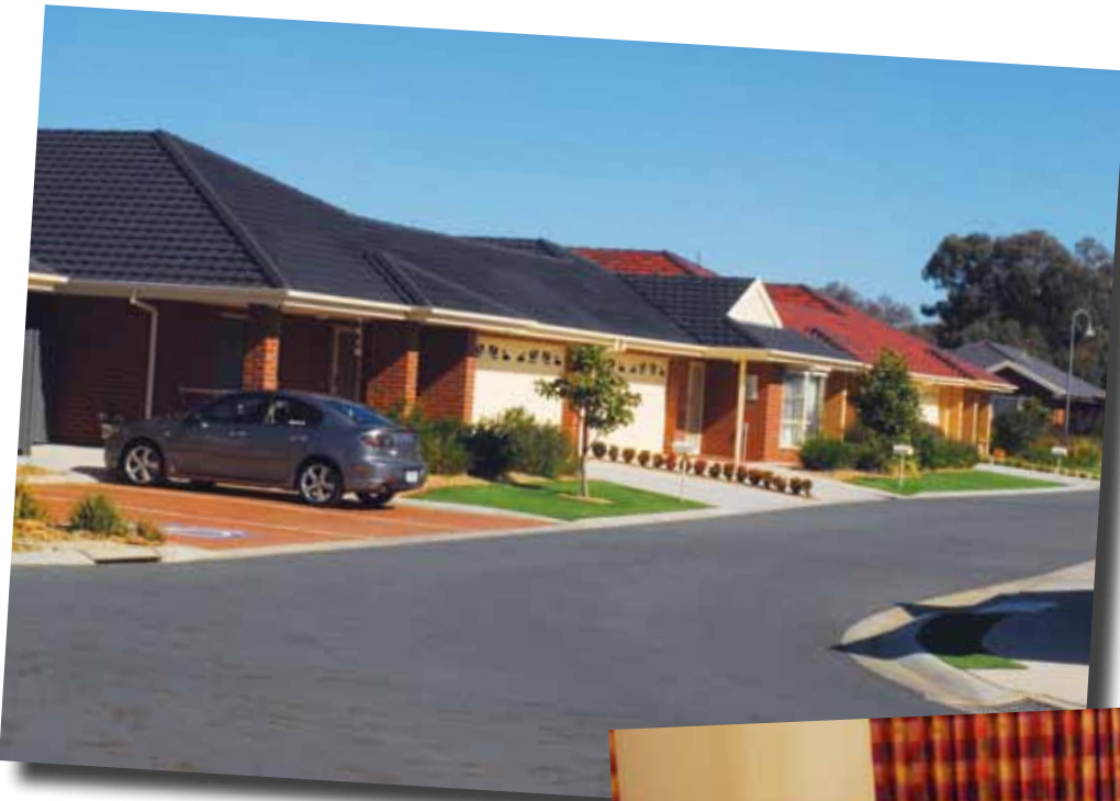
Cunningham Downs Village

For further information please contact the Director of Care Services at Wharparilla Lodge.